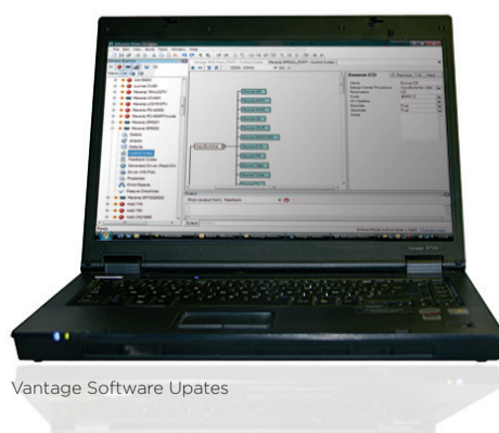
Vantage Software Updates