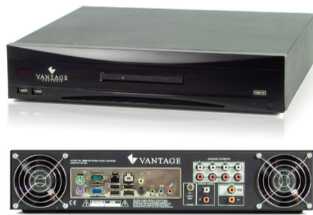
DMM Digital Music Manager