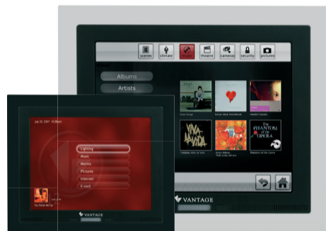
TPT650 and TPT1040