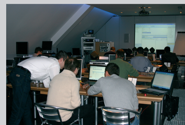
Vantage's Infusion Advanced Training (November 2008)

For subscriptions, training dates or training info: www.vantage-emea.com