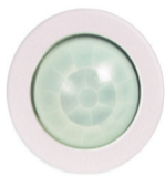
Mini FlushMount Motion Sensor 360° FL-MS MINI 360°